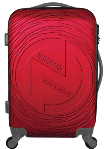
CUSTOM PANTONE CASE 300PC MIN