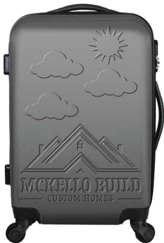
STOCK GREY CASE 100PC MIN