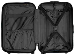
BLANK STOCK BLACK LINER