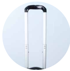
UPGRADED HANDLE & TROLLEY $5.80 R