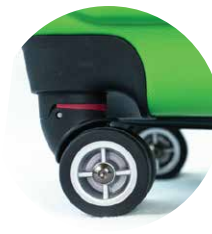
4 DUAL WHEEL SPINNER $5.80 R