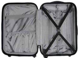
BLANK STOCK GREY LINER