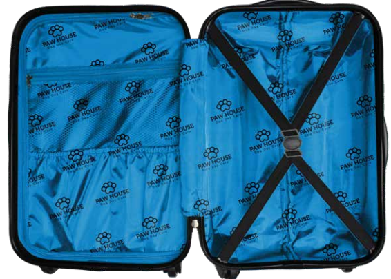
CUSTOM FABRIC LINER WITH 1 COLOUR PRINT 500PCS+ only N/C