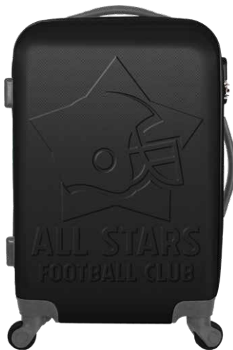
STOCK BLACK CASE 100PC MIN