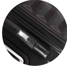
2 USB PORTS (POWERBANK NOT INCLUDED) $7.25 R