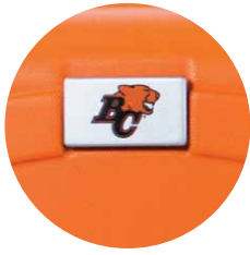
CUSTOM DEBOSSSED METAL PLATE $5.25 R