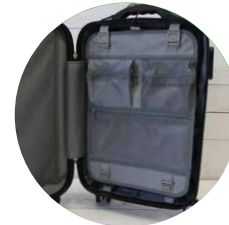
REMOVEABLE TOILETRY DIVIDER WITH HANGER $8.90 R