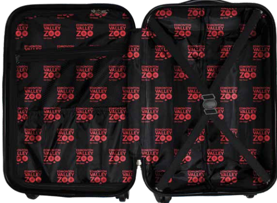
BLACK OR GREY LINER WITH 1 COLOUR PRINT 300-499PCS. $5.80 R