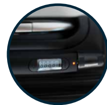
WEIGH SCALE HANDLE $15.30 R