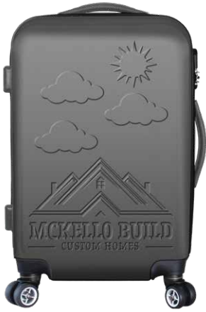
STOCK GREY CASE 100PC MIN

STOCK COLORS 100PC MINIMUM PANTONE MATCH COLORS 200PC MINIMUM