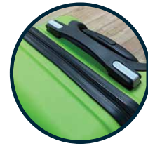
UPGRADED HANDLES $4.95 R