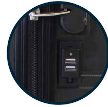
2 USB PORTS (POWERBANK NOT INCLUDED) $6.30 R