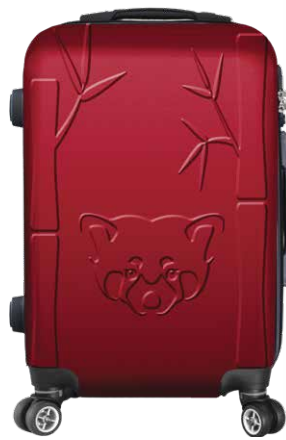
CUSTOM PANTONE CASE 200PC MIN