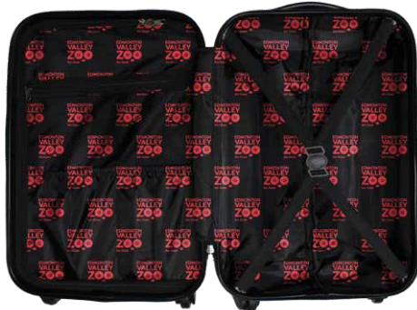
BLACK OR GREY LINER WITH 1 COLOUR PRINT 200+PCS. N/C