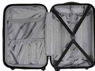
STOCK GREY LINER - BLANK 100-199 PCS. N/C