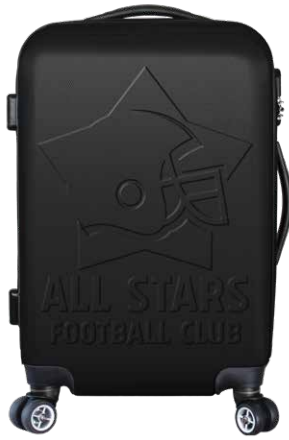
STOCK BLACK CASE 100PC MIN