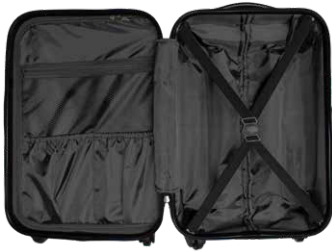
STOCK BLACK LINER - BLANK 100-199 PCS. N/C

NO PRINT 100PC MINIMUM 1 COLOR PRINT 200PC MINIMUM