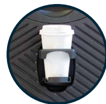
NEW! BACK CUP HOLDER $9.00 R 200PC MIN

CUSTOM OVERSEAS PRODUCTION. LEAD TIME 12 - 16 WEEKS FROM PROOF APPROVAL (VARIES BASED ON TIME OF YEAR). FOB EDMONTON, AB. PRICING SUBJECT TO CHANGE WITHOUT NOTICE. USD$