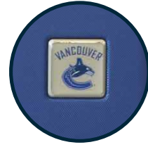
CUSTOM METAL PLATE $4.50 R