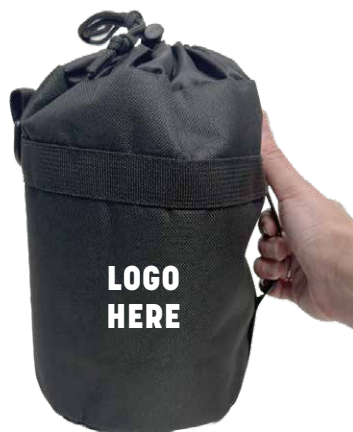
CARRY BAG WITH HANDLE INCLUDED