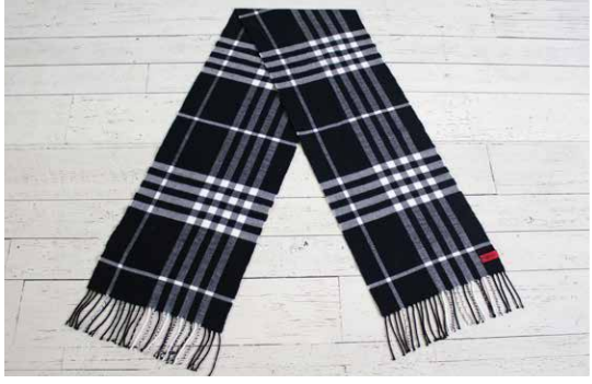
BLACK PLAID - SHOWN WITH RED RIVETED PATCH* NOT INCLUDED IN DECORATED PRICING