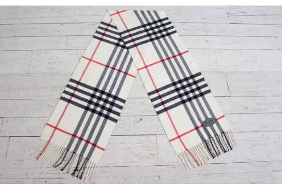
WHITE PLAID - SHOWN WITH GREY PATCH

Decorated price includes Embroidery (up to 8K stitches) or Laser Patch (2" x 3" / custom shape up to 9sq"). Set up fee is additional. 1 standard location. Some restrictions apply.