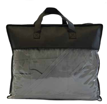
PACKAGING - FRONT