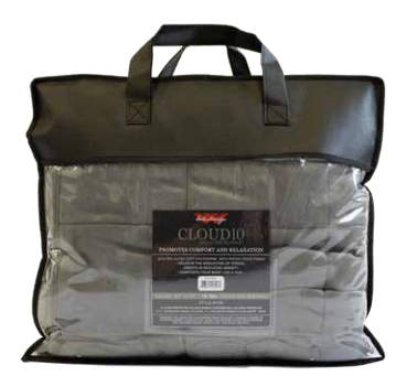
PACKAGING - BACK