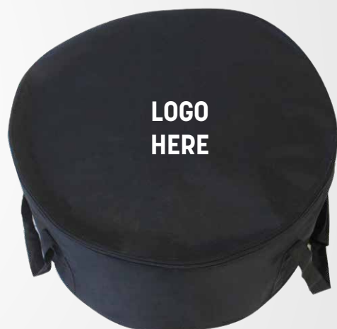
CARRY BAG INCLUDED

This CSA certified fire pit is safe to use during most campfire bans and can rival most natural campfires. It's easy to set up and requires no tools! It features stainless steel burner & fasteners, chrome knob with rubber comfort-grip, and steel construction with high temperature powder coating and protective enamel finish for long lasting durability.