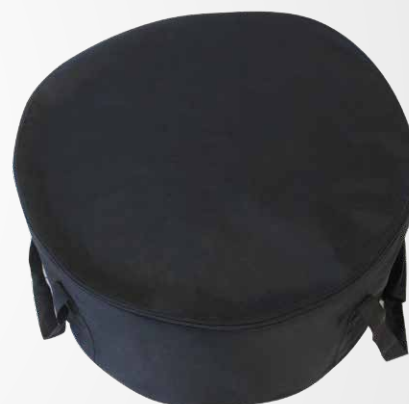
CARRY BAG INCLUDED

This CSA certified fire pit is safe to use during most campfire bans and can rival most natural campfires. It's easy to set up and requires no tools! It features stainless steel burner & fasteners, chrome knob with rubber comfort-grip, and steel construction with high temperature powder coating and protective enamel finish for long lasting durability.