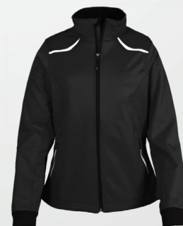
753 - Black/Black