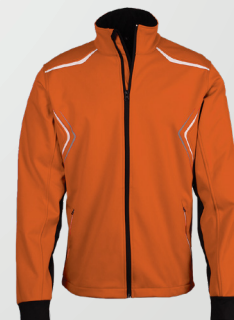
751 - Orange/Black