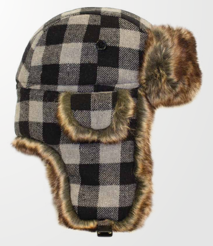
EAR FLAPS DOWN FOR ADDED WARMTH